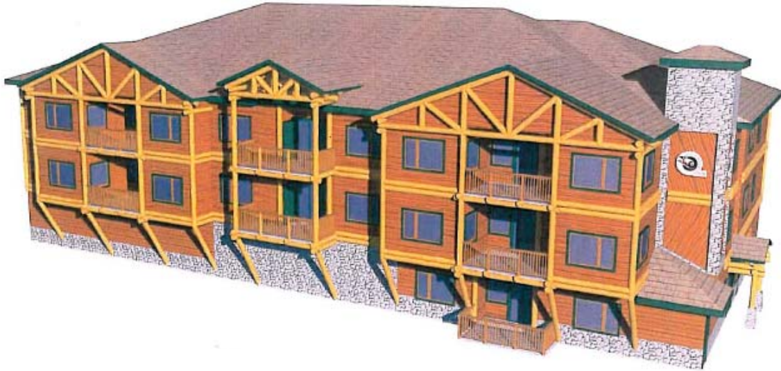
UNIT "A" UPPER FLOOR END UNIT 1110 Sq Ft 2-BEDROOMS, 2-FULL BATHS